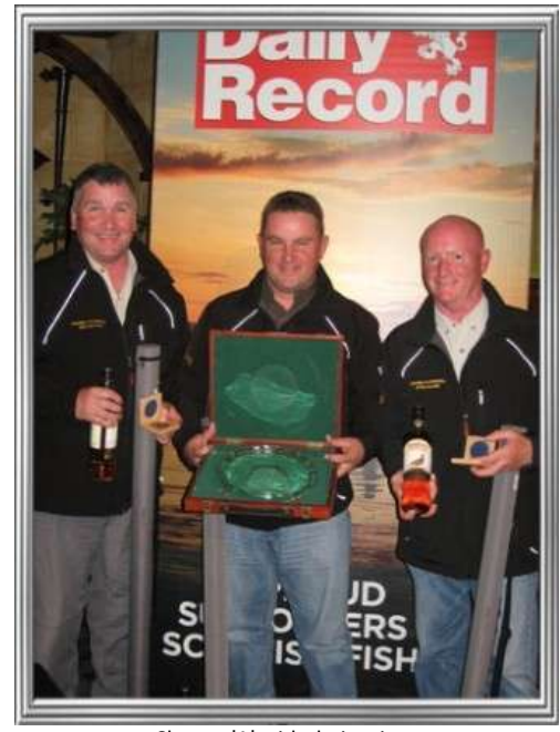
Change 'A' with their prizes