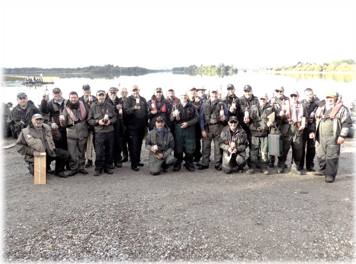
The National Boatmen with their bottles of Famous Angler Whisky

The hook/fly measures used throughout the competition were sponsored by 7Plus7 Construction and the waterproof paper used for the catch returns was sponsored by R & E Hygiene. Famous Grouse provided a bottle of "Famous Angler" whisky for each of the boatmen who helped out on the day.