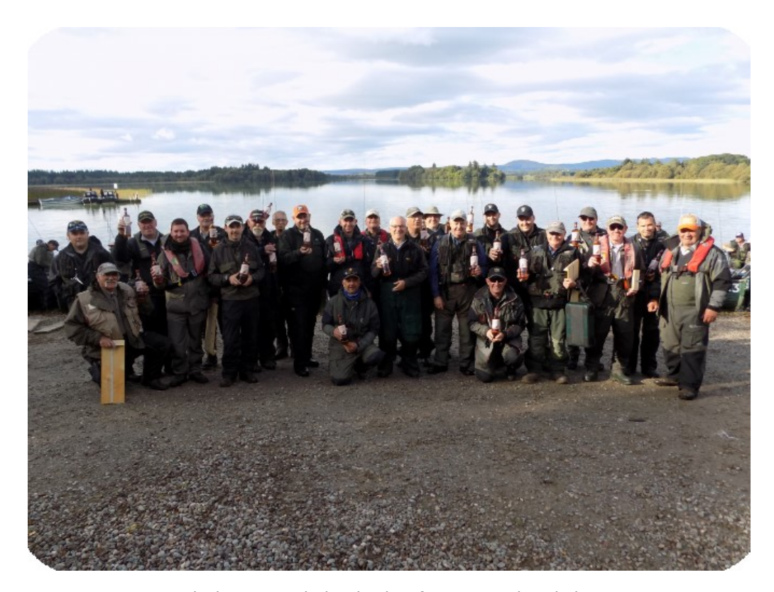
the boatmen with their bottles of Famous Angler Whisky